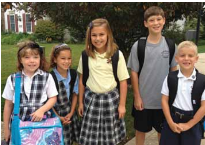
SFX students on their first day of school, ready and eager to start the new year. Teachers will emphasize the need for "respect" for God, self and others.