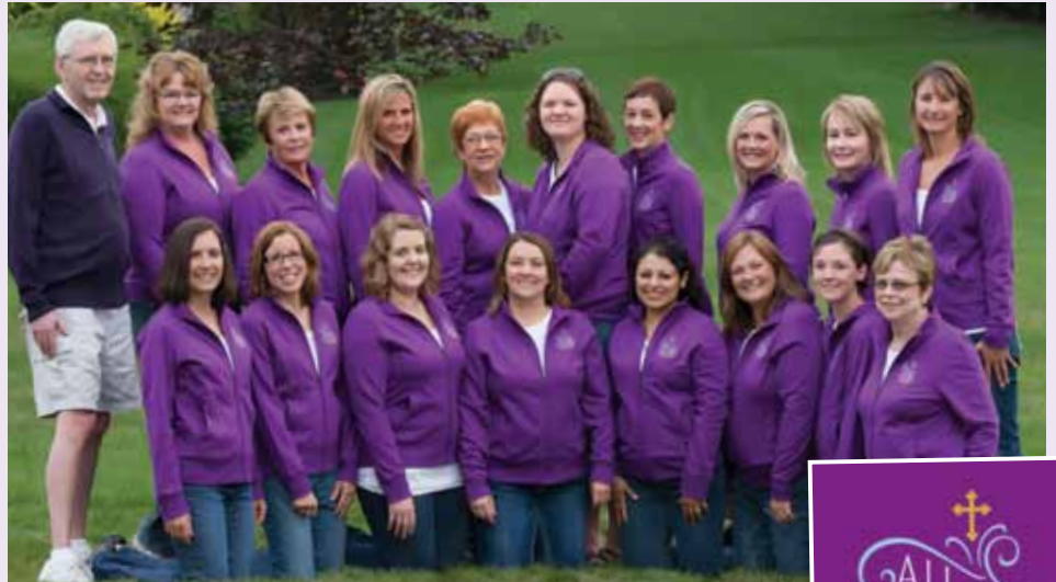
The 2013 Christ Renews His Parish Women's Renewal Team invites all women of the parish to join them Oct. 19-20 for renewal.