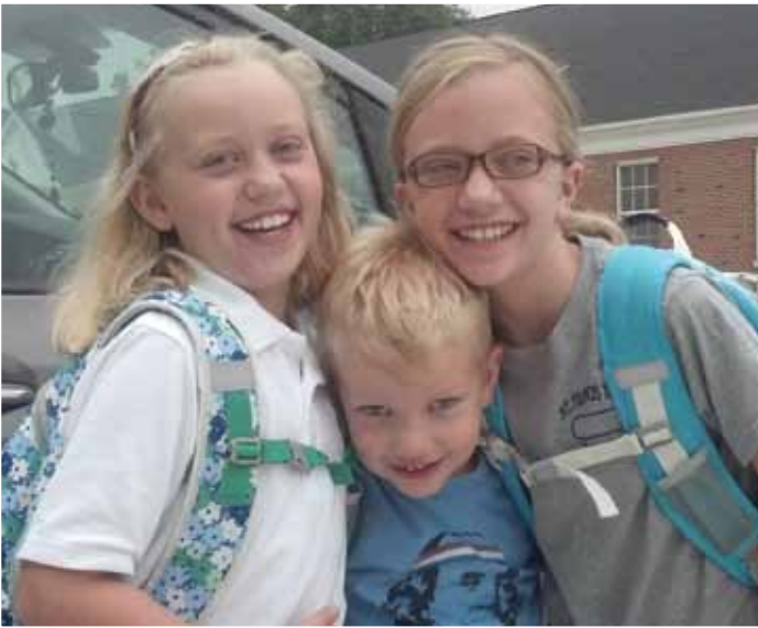
Children were excited to return to school Aug. 19. Their last day will be June 2.